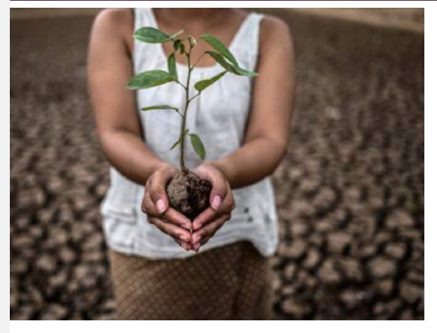
Topic 1: African Women as Climate Change Champions

While the voices of women must be included across all conversations related to climate change, it is also important to