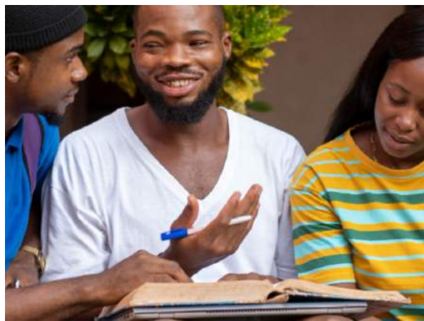
Topic 3: African Artists in the Climate Change Movement: Catalysts for Social Change

This panel will explore the role of African artists as agents of transformation and how African artists have embraced this responsibility with unwavering dedication.