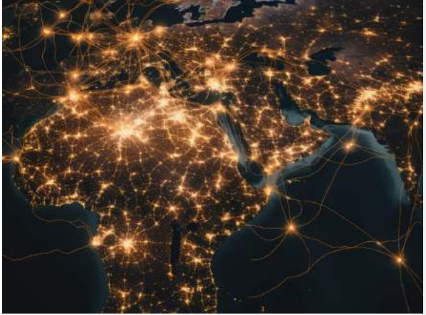
Topic 2: The Role of Tech & Connectivity in Africa

While the voices of women must be included across all conversations related to climate change, it is also important to