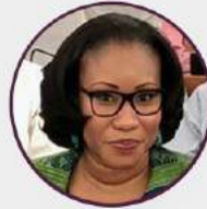
H.E. Ramatoulaye Diallo CEO of Great Green Wall of Africa Foundation and Former Minister of Culture in Mali